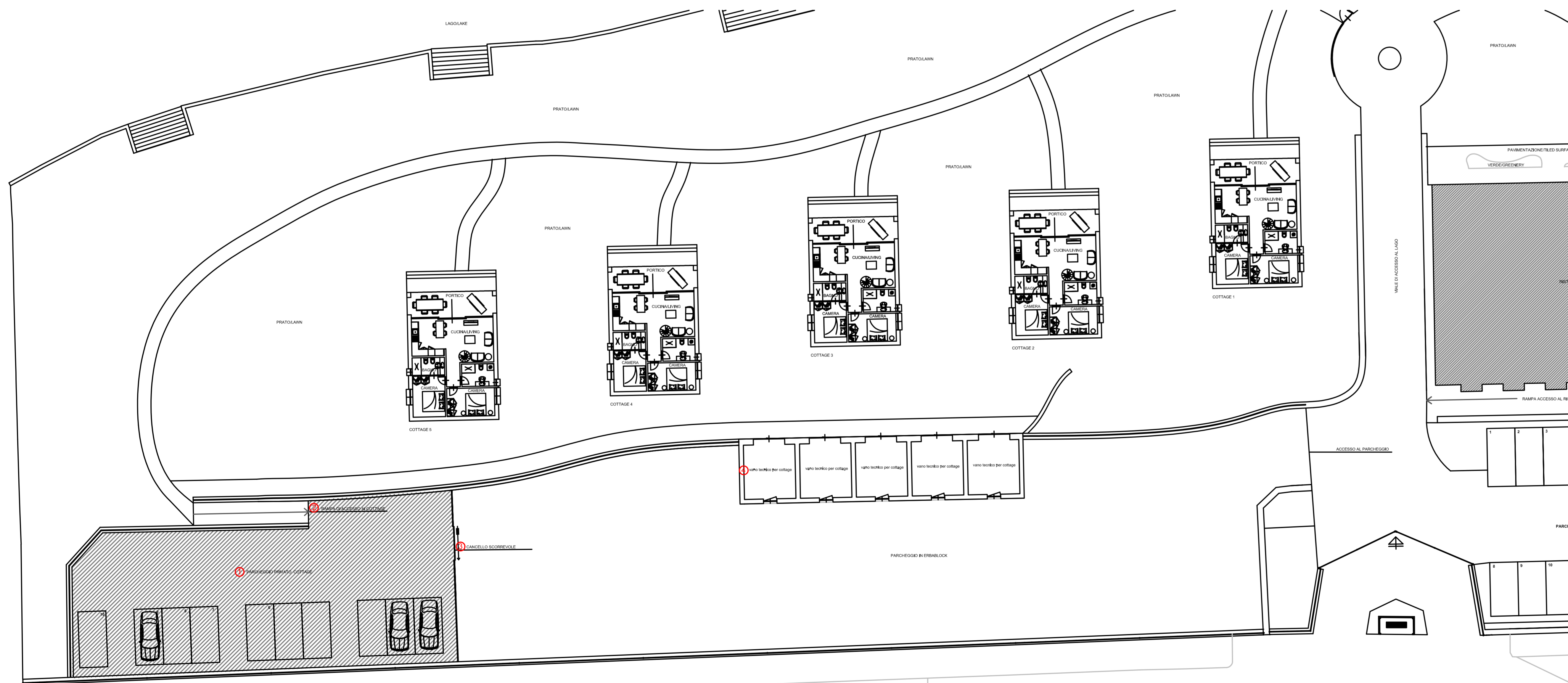
PLANIMETRIA GENERALE COTTAGE CON VANI TECNICI SCALA 1:200